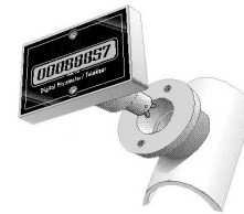
SADDLE MOUNT MODEL